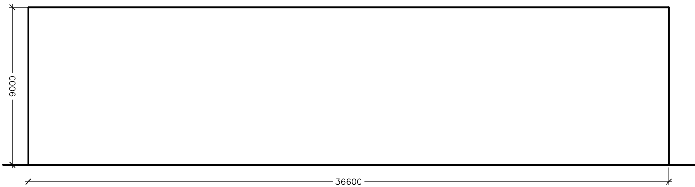
SIDE ELEVATION NTS